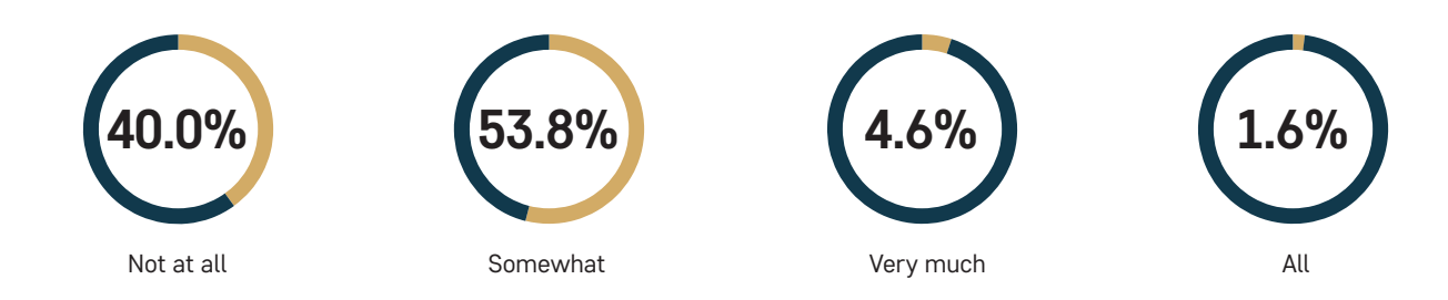
G. 1 CITIZEN'S SUGGESTIONS

According to the Riinvest Institute Public Opinion poll only 6.2 percent of the citizens believe that their suggestions will be considered during the decision making process of their municipalities. In addition, 40 percent of the citizens do not believe that their suggestions will be considered, while 53.8 percent somehow believe that they might be considered.